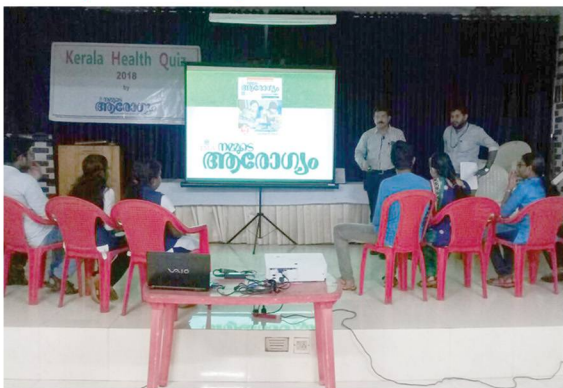
The final round Quiz in progress